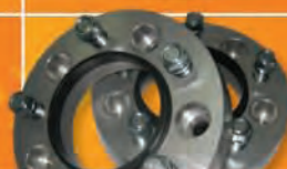
HIGH PERFORMANCE HUBS